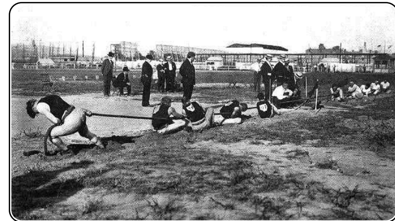
Discontinued: Tug-of-war & Pistol duels

Some of the earlier Summer Olympics featured tug-of-war as a team sport. Most athletes competed in other events as well. It was eventually discontinued after the final competition at the 1920 games.